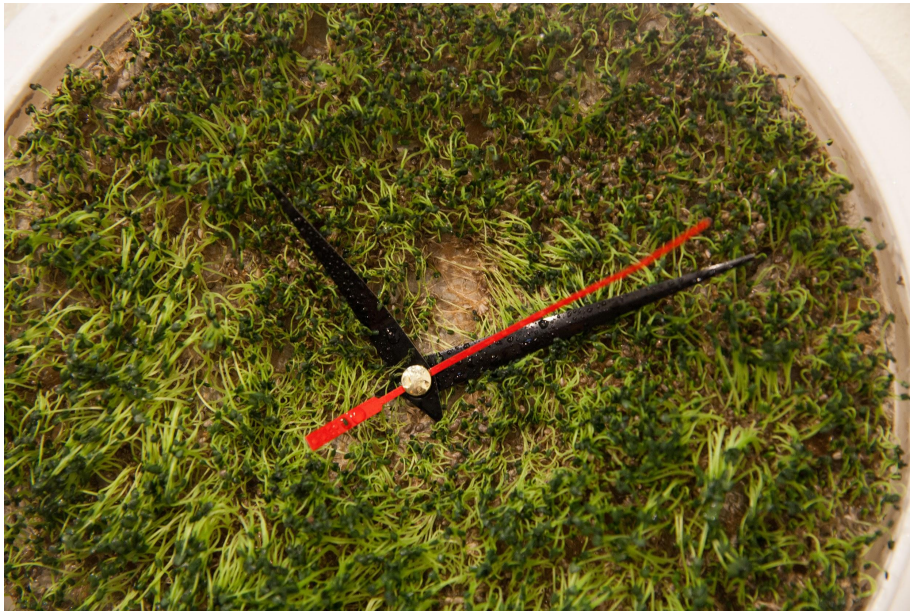
Figure Twelve: The Waiting Room (Detail) , 2019

work involved the organic nature of clay, which in essence is unsterile and can contain water for life. The everyday notion of watching something grow and eventually die was a metaphor for the human connection to nature and mortality. Time is a human construct, and nature is not tethered to time like we are, so this clock was a reminder to be in the present and to consider growth, progression, and decay as processes that are part of the body.