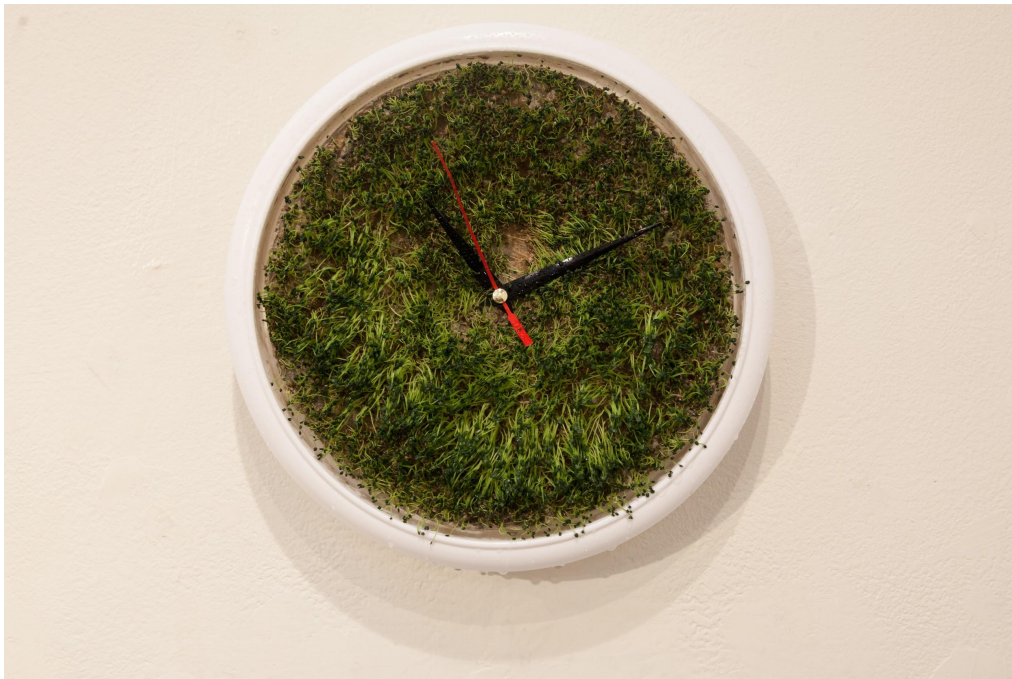
Figure Eleven: The Waiting Room (Detail) , 2019

head might fall off into the water and decompose, where later, the carbon that was in my hair might be absorbed by a fish's gills. Bodies are soft and form a reciprocal relationship with the environment, for what is expelled from the body goes into the world, and what one absorbs goes into the body. In my work, I see this cycle as something necessary for human comfort and I try to reinstate this cycle to erode layers of sterility. Most medical instruments or furniture maintain the function to serve the patient and to prevent cross-patient exposure. To mitigate the hospital's dependence on the sterile barrier and the triggering quality that these spaces have on those with illness, this piece functions in the gallery space to create an absurd, slightly humorous relationship.