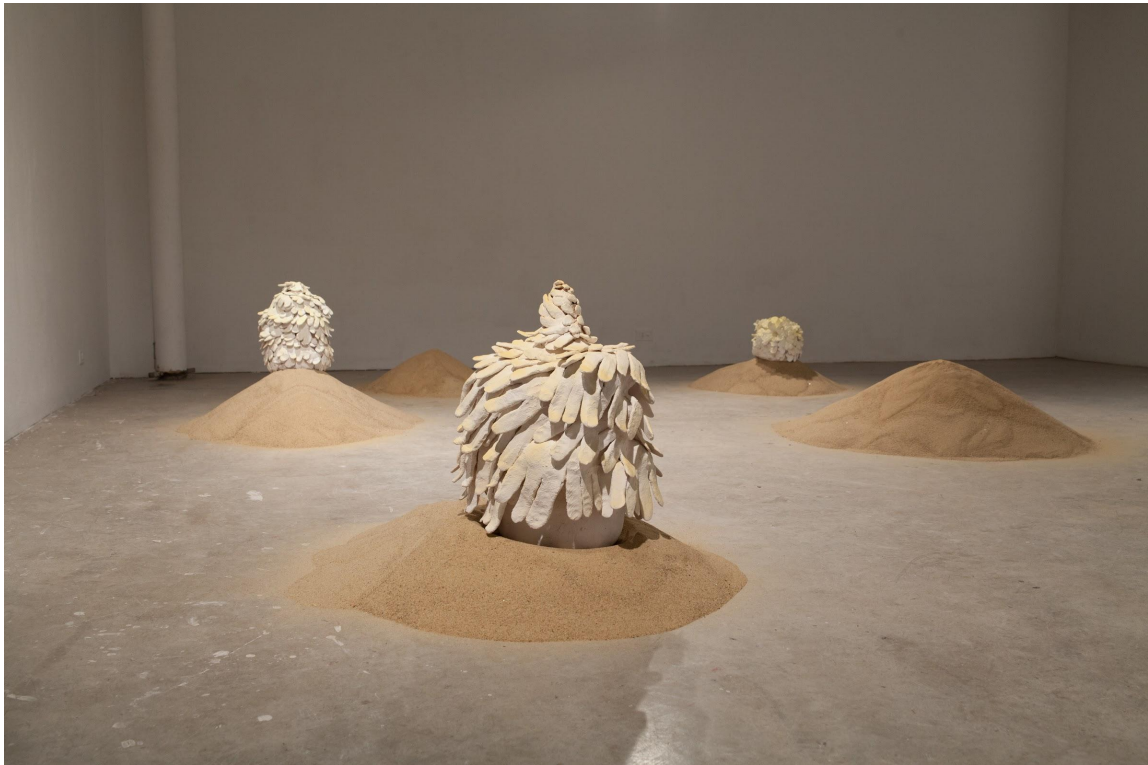
Figure Three: Fruit Cycle , 2018

someone who was directly dealing with the abject effects of chemotherapy, I examined what the hard sought image of someone with a mindful, healthy lifestyle might entail realistically. My body was losing hair and rapidly multiplying cells quickly, and I questioned how to categorize my state of being in the media. Wellness had become crucial for my immunocompromised body, but also for people in other age ranges existing on a variety of medications and treatments. The innermost principles of wellness and mindfulness are not at fault, but the capitalization of those efforts has created an idealized image that many cannot achieve.