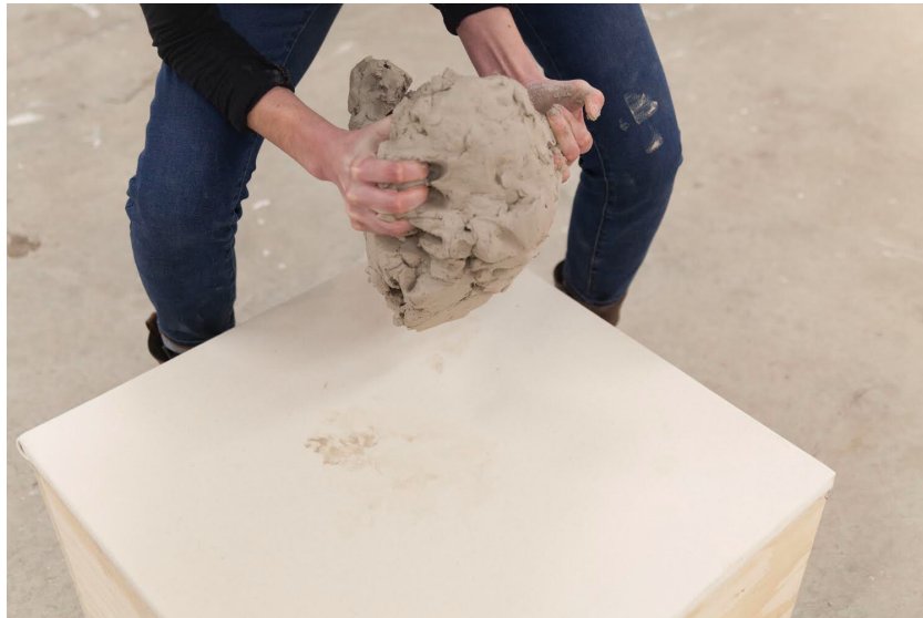
Figure Fourteen: The Weight Of Worry (Video Still Image), 2020

My voice became muffled and incoherent to the listener when the clay was placed back down on the canvas. By lifting the clay and straining one's muscles, the participant would become an active listener, and other participants present could also listen to my voice. Additionally, there was a bucket filled with water and a sponge to wash off and dry one's hands after the clay was touched. This process of shifting one's weight to accommodate the clay, listening carefully, and washing off the clay residue into the water became a ritual of actions similar to how stories surrounding illness are transferred and grieved.