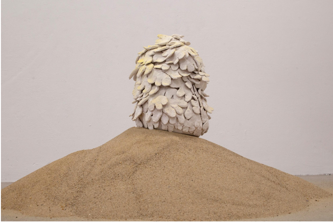
Figure Four: Fruit Cycle (Detail), 2018

In my work titled, Fruit Cycle , I created three closed ceramic forms that had flora like appendages and represented plant bodies. Each design was spaced out and placed on a mound of sand. Spread out in a circle on the floor, each ceramic piece displayed a similar yellow-pollen color on the exterior, and each successive form was larger than the last with anthropomorphized appendages that became longer and stretched out like flat fingers. In between the plant-like bodies were mounds of sand that had nothing on them and were visual points of absence along the cycle. My intention was for the forms to be viewed as an organism growing along a lifecycle, and the exact progression's ending to be open for viewer interpretation. Considering the youthful, able-bodied, and highly stylized bodies that are portrayed in the media, I aimed to have the viewer recognize what stage along the cycle contained a potential for bloom or perhaps death. The absence of potential sculptures on the empty mounds allowed for other steps to be reconsidered as it relates to stages of human life. While this idea did aim to shed light on problems within institutions with wellness agendas, it did