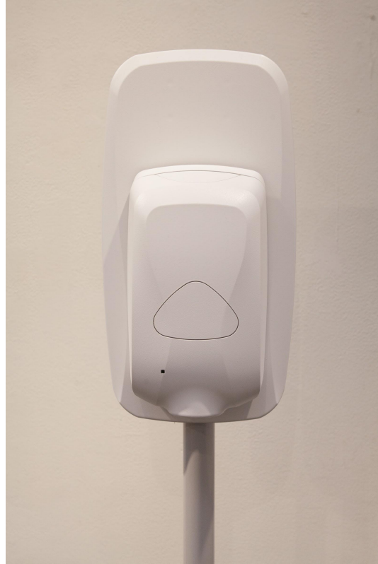
Figure Ten: The Waiting Room (Detail) , 2019

Similarly, in my installation, The Waiting Room , I utilized the blank, white aesthetic of medical instruments such as sanitizer dispensers to mimic sterile spaces, but I altered their initial purpose. Participants could activate the hand sanitizer dispensers, but only clean water would come out. The leftover water on their hands could then drip-dry onto a bed of grass on the base of the dispenser stand. By providing my audience with water and not a product with a specific purpose, the memories typically associated with the smell of sanitizer are kept separate. Additionally, by allowing the water to fall onto the grass, the participant becomes part of the environment and the cycle.