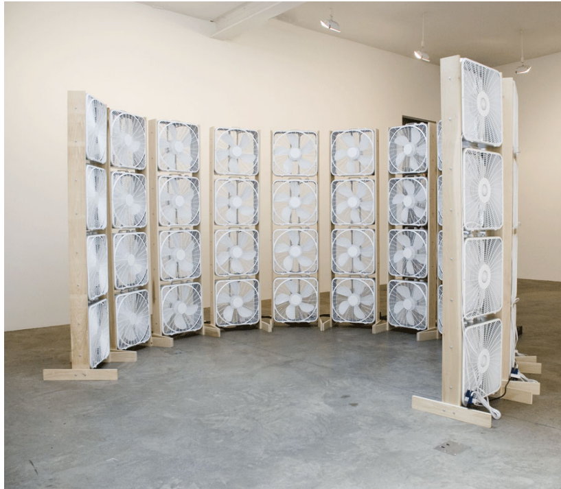
Figure Eighteen: Spencer Finch, 2 hours, 2 minutes, 2 seconds (Wind at Walden Pond, March 12, 2007)

unique place and also allow for my audience to project their expanse and their fantasy of the ocean.