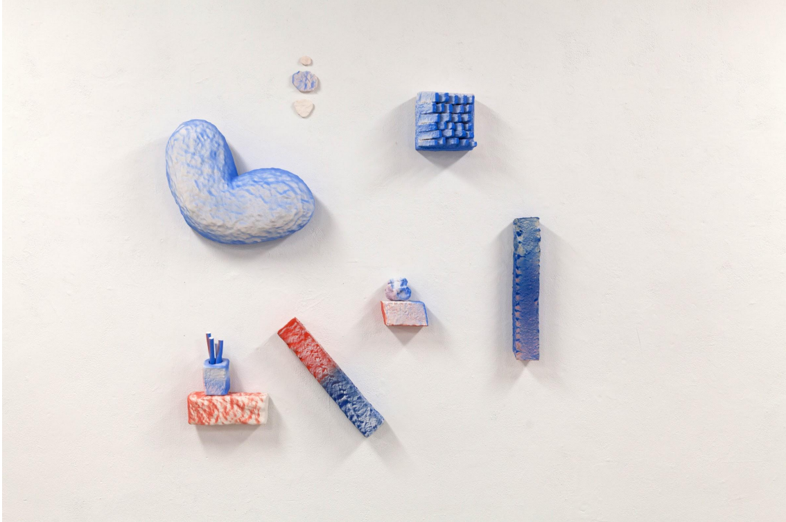
Figure One: Autofill Objects , 2018

In my piece, Autofill Objects , ceramic parts were made with the same color scheme of arcade games like Galaxia or Tron from the '80s, where color schemes were limited because of the available screen colors at the time. A strong example of this was the widespread and still prevalent red versus blue player occurrence in multiplayer games. The airbrushed effect of the surface also is reminiscent of shaded relief maps or bathymetric maps made using DEM (Digital Elevation Models) where computers would shade elevation simulating where the sun would be projecting. While I manually applied color to create a shadow on the terrain of the clay texture, a similar visual effect occurs and places the work in a particular era. Each piece hung on the wall was fashioned similar to household objects or shapes in video game worlds. I chose to use the forms of household objects loosely because domestic items are easily recognizable. The result was an abstraction of different forms, and the intent was to allow for the varying works to either be categorized into the actual world or virtual world based upon memory. Additionally, because