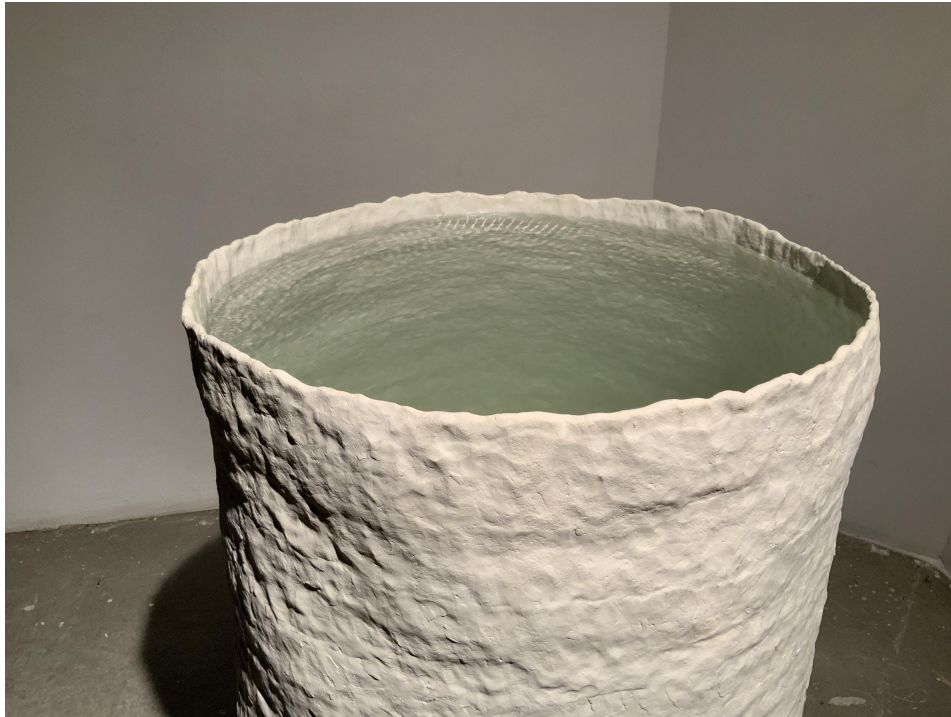
Figure Seventeen: The View from a Doldrum (Studio Image), 2020

water, vibrations from that place were transferred via vibration, and the water's reflection mirrored the wind patterns of the ocean.