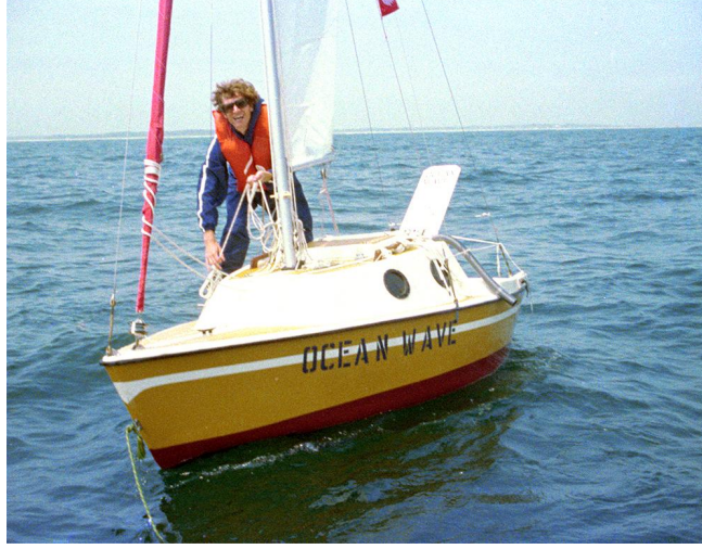
Figure Nineteen: Bas Jan Ader, Photograph before In Search of the Miraculous , 1975

Looking back on my fascination with the ocean, I realize that my fixation during my cancer treatment bordered on magical thinking. Sound, light, and certain materials can transport us to a place that is isolated in our imagination, and I am interested in how an expanse can enhance escapism and magical thinking. In psychiatry, magical thinking refers to the idea that you can influence the outcome of specific events by doing something that has no bearing on the circumstances. 12 Similar to holding one's breath in a tunnel or not stepping on cracks, children are often known to begin fantasizing in this way when the finality of death first comes into their life, and magical thinking overarches this gap of understanding. However, I do not think that we stop this process of magical thinking in adulthood, nor am I very sure if anyone is certain of death or what it holds. While magical thinking may not be tethered to logic, I believe it can be useful for understanding one's desires and dreams. This is what I want to facilitate as part of an imaginative act to grieve and heal in my work.