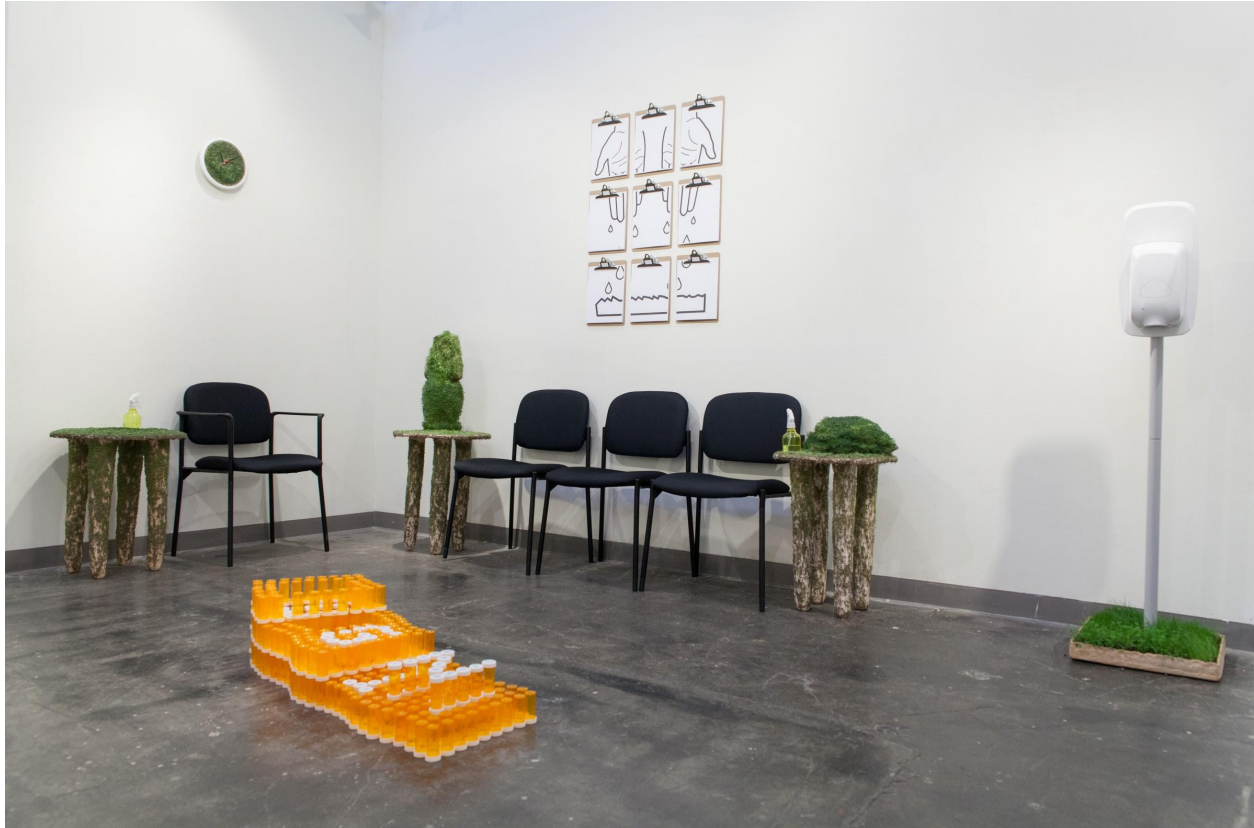
Figure Seven: The Waiting Room (Installation View), 2019

In one component of my installation, The Waiting Room , I considered instructional plaques and simple directives that are present throughout high traffic hospitals and altered the imagery to reflect my desires in a traditional waiting room setting. The bold lines and simplistic caricatures of human hands are present, but the other parts of the image are ambiguous. The graphic itself is spread out over a grid of clipboards that would be traditionally hung in a triage for staff to read patient history. By customizing the directive language of the system, the absurdity of the language is exposed. The directives are either calming or confusing, depending on how the image is perceived. This ambiguous language reaffirms how hospitals often perpetuate an environment that feels unknown when patients are already in unfamiliar territory