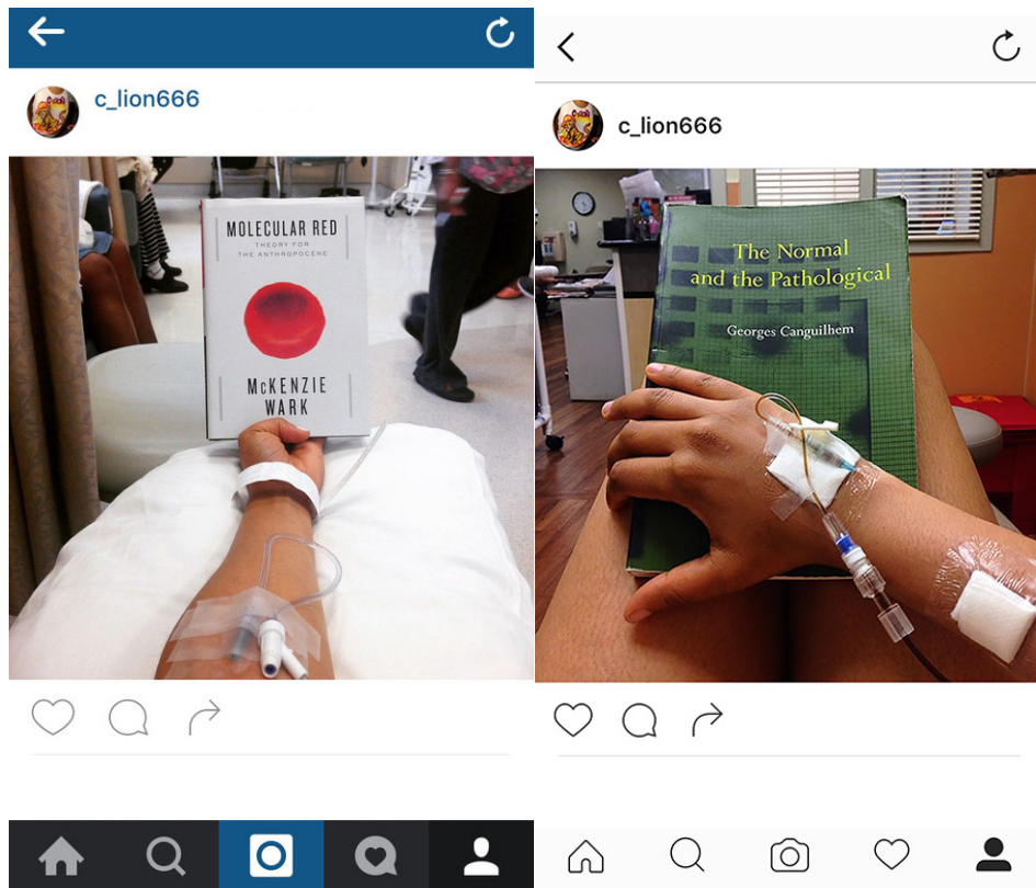
Figure Six: Carolyn Lazard, In Sickness and Study (Site-specific on Instagram), 2015

provided me with information packets about my cancer stage type, but the scientific jargon always felt a bit unfamiliar. I had to rely on the larger system, and this is anxiety-inducing to put hope in the hands of strangers. In Carolyn Lazard's ongoing series In Sickness and Study , she takes these stills from Instagram as part of a project where she uses the books read to inform herself as she goes through the healing process within the hospital. To have agency over one's body within a system requires one to understand the lingo between hospital staff, anatomy of the body, and partial chemistry to feel like one has some control. In seeing these images, I felt empathy because there was an exhaustive amount of research involved within my chemotherapy and radiation regimen. This work provided a new way for me to consider my experience with Biomedicine, and I recollected struggles with language in the institution for my work.