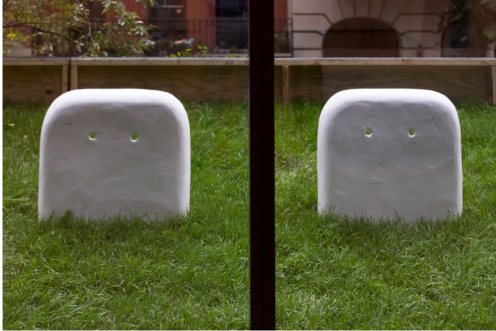
Figure Sixteen: Robert Gober, Two Partially Buried Sinks , 1986-1987

In my situation, a sink was often where I contemplated death and what it held for me, ironic as it might be that I positioned my head over something that gave me water, life, or substance to make myself clean. This object acts as a futile device if one has ever been severely sick. These sterile basins are truly life-giving to those who are healthy but are useless and sometimes morose for those that are experiencing their body failing. All this said, his work made me recognize how a vessel can have a strong memory attached to it, and the amount of water or lack of it can generate emotion.