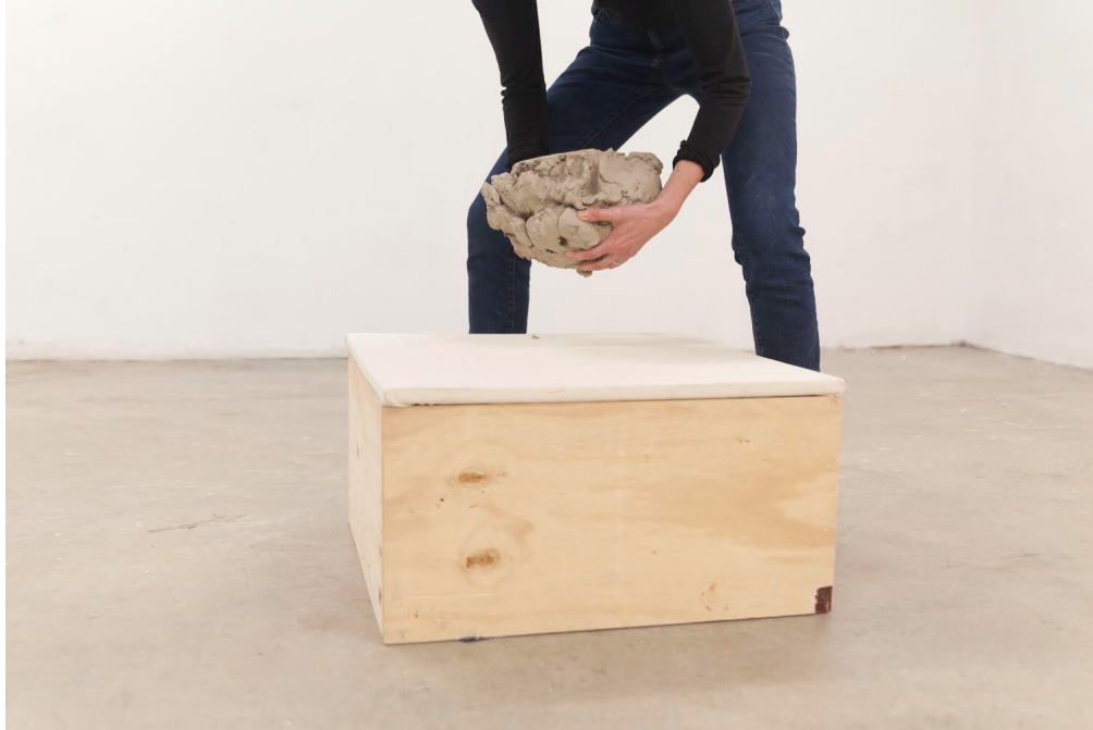
Figure Thirteen: The Weight Of Worry (Video Still Image), 2020

Everyone who is born holds dual citizenship, in the kingdom of the well and in the kingdom of the sick.” 10