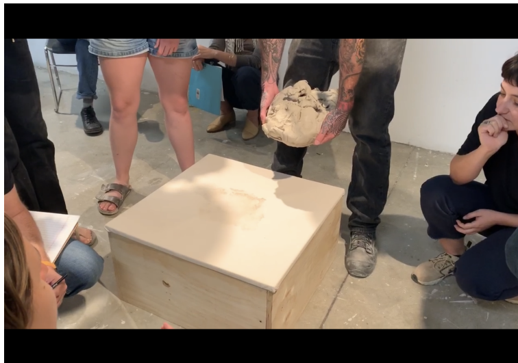
Figure Fifteen: The Weight Of Worry (Video Still Image), 2020

The effects of the work dramatically changed based upon how many people were present; each interaction presented a potential for listening to occur differently. If a group encountered the piece, there would usually be a passing of the clay from person to person to split the load amongst everyone to listen. Sometimes a single person might come and lift the clay for the whole five minutes, or a person might not feel inclined to lift the clay at all and would just stare at the work and listen to my muffled voice. Each iteration has opened up a new opportunity for how the work can be received and within these possibilities further metaphors for how grief is shared amongst people.