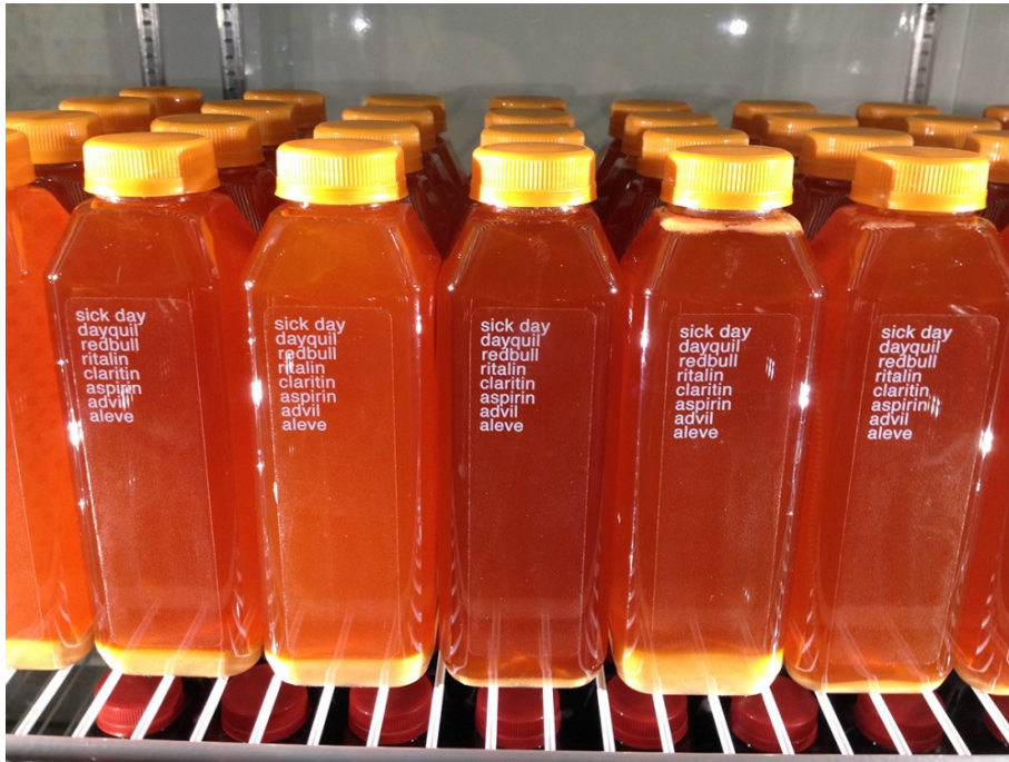
Figure Five: Josh Kline, Skittles , 2014 (detail)

medicine. When people are so reliant on a network, especially economically, it breeds compliance, and to begin addressing this, I wanted to discuss ways in which the institution fails from a personal level. Due to the many triggers within the hospital, it is important to note various ways in which agency can be given back to patients by subverting the actual language and trauma.