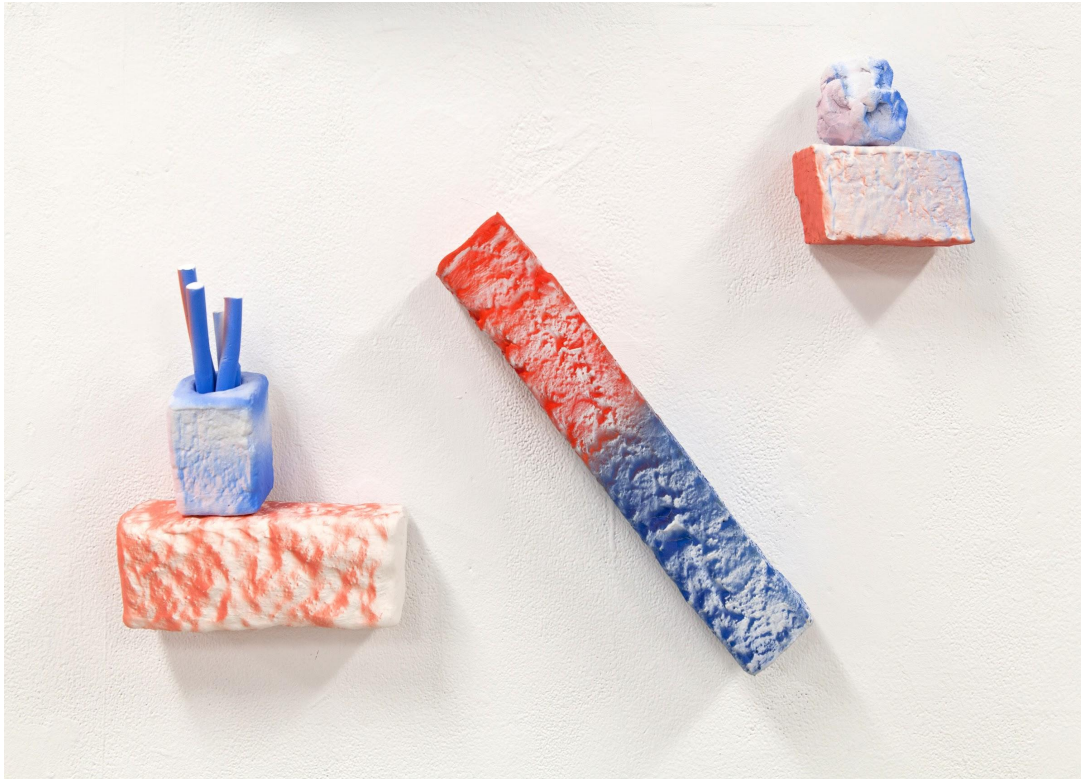
Figure Two: Autofill Objects (Detail), 2018

this work was on the wall and placed in a gallery, it was similar to 3-d images on a screen that one cannot touch yet understands visually. This work is what led to an examination of visual aesthetics and the potential to pull an audience out of this world via imagination and projection.